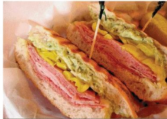
FROM LEFT: Panini Insalata from Insalata in Troy is flavor-intensive.